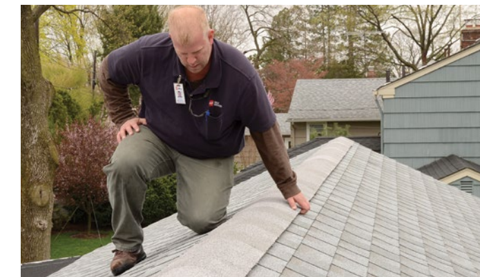
Ensuring attic ventilation and accessories are installed properly to maximize performance and prevent future leaks.

PERFORMED BY GAF'S PROFESSIONAL INSPECTION TEAM