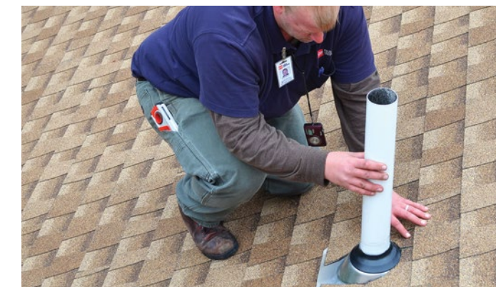
Ensuring flashings are installed properly to protect the roof deck and living space from water damage.

• Comprehensive Inspection* Helps Identify Problems... Before they happen