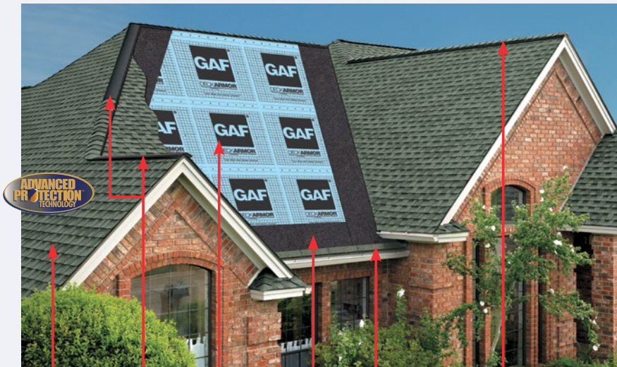
LIFETIME SHINGLES COBRA® ATTIC VENTILATION ROOF DECK PROTECTION LEAK BARRIER STARTER STRIP SHINGLES RIDGE CAP SHINGLES