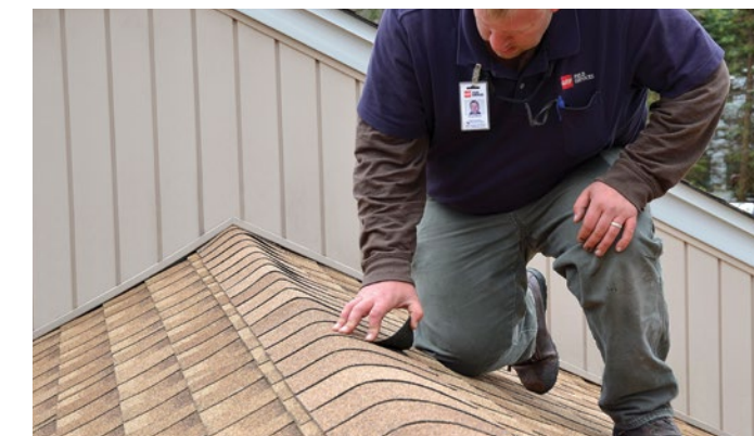
Ensuring ridge cap shingles are fastened properly and to the correct exposure, avoiding shingle blow-off.